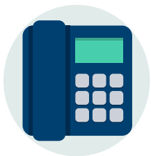
Home phones that use voice calling over the internet (known as VoIP)