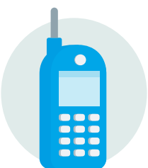
Most cordless home phones on any technology